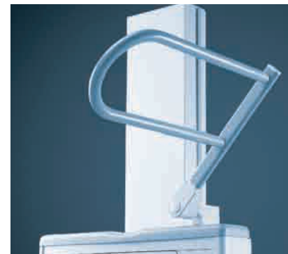
Overhead wall Bucky hand grip