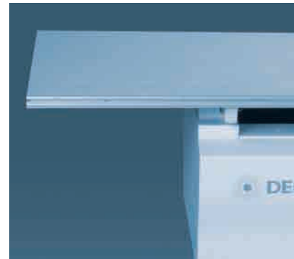
Carbon fiber tabletop